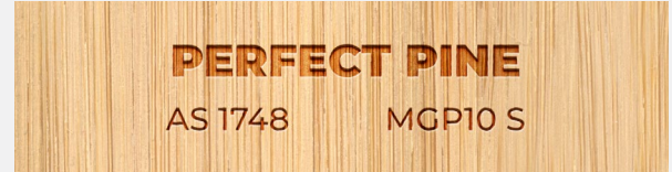
Machine stress graded softwood