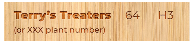
Preservative treated timber (64 is the preservative and H3 is the Hazard Level). Identification may be ink brand or end tag.