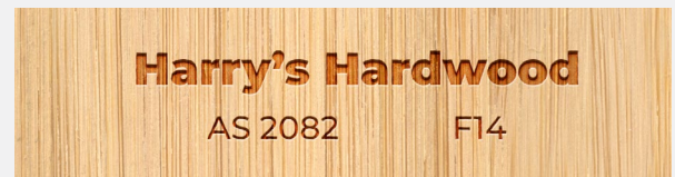
Visually stress graded hardwood