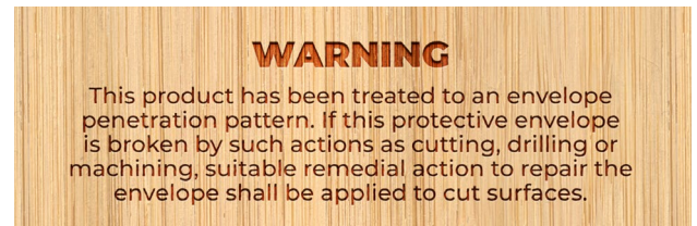
Label where required on envelope treated timber such as LVL, Plywood, Glulam and Reconstituted Wood products. This does not apply to H2F envelope treated framing.