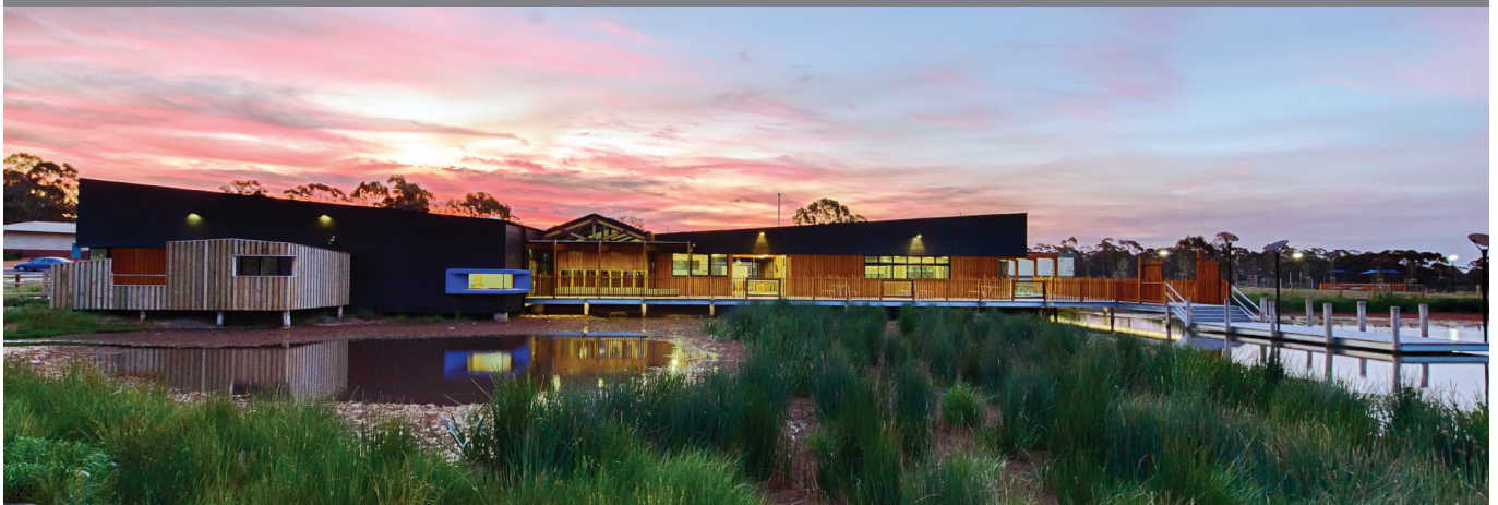
Figure 1 Montagne Centre at Marist College in Bendigo (Image courtesy of Marist College Bendigo). Architect - Y2Architecture, Photographer - Press1 Photography

partitions. The principal of Marist College has noted that the students who work within the building have been noticeably calmer which is attributed to the connection to nature that the building has through location and the use of timber and other natural materials.