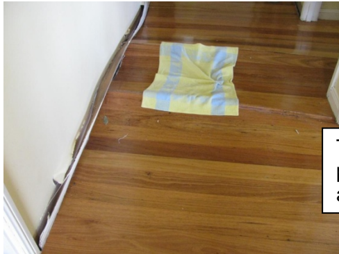
This inundated T&G floor over particleboard tented about 1 week after the water receded.

The flooring may continue to swell or expand across the boards for a period of time even after the water has subsided as moisture moves deeper into the timber. After cleaning, assess the extent of swelling and or tenting of boards (lifting off the supports). Check to see if there is still clearance between the edges of boards and the bottom plates of walls (usually under the skirting board) and to see if the flooring has expanded and started to push wall frames out at the bottom. If necessary relieve the pressure on walls by removing or cutting out perimeter boards. Eliminate any trip hazards that may have arisen due to tenting of boards or lifting of nails etc.