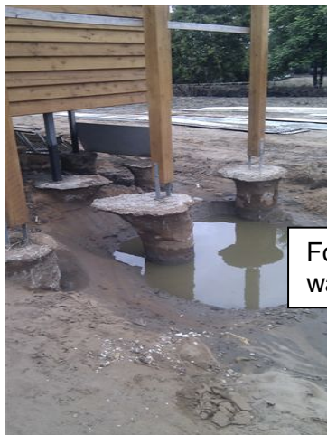
Footings scoured out by fast flowing water

NOTE: Where fast flowing water has impacted on the dwelling, joists and bearers may have shifted/twisted and walls and windows may be out of square etc. Any excessive misalignment should be corrected before new cladding or lining is installed.